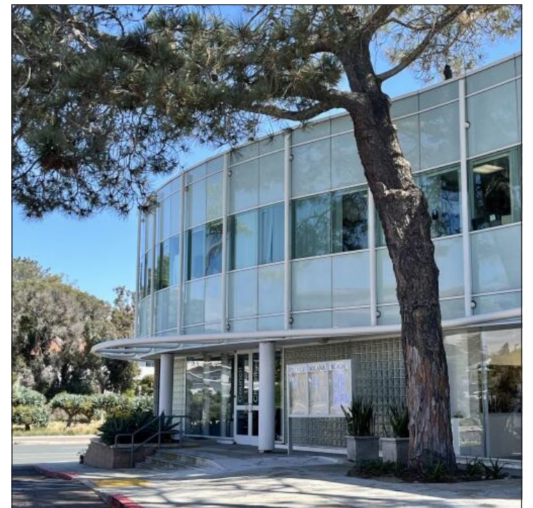
Solana Beach City Hall.