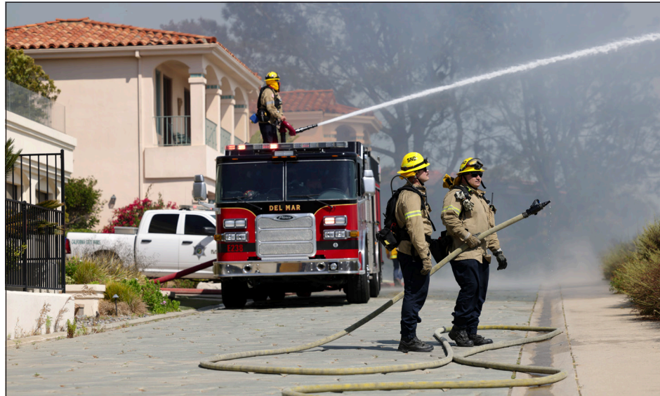
Firefighters work next to homes that were evacuated near the end of Mira Montana as a brush fire burns in the Torrey Pines State Reserve Extension area in San Diego on June 25, 2024.

“The day-to-day stuff, I think we are doing great. Our relationships are good, we have great firefighters on the floor who do an amazing job, day to day,” he said. “But when that big event comes, one of the questions was asked — what (emergency operations center) would I be going to? And it’s hard to